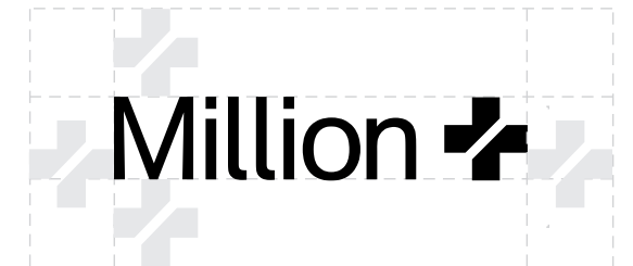
Million + logo always in one colour application.